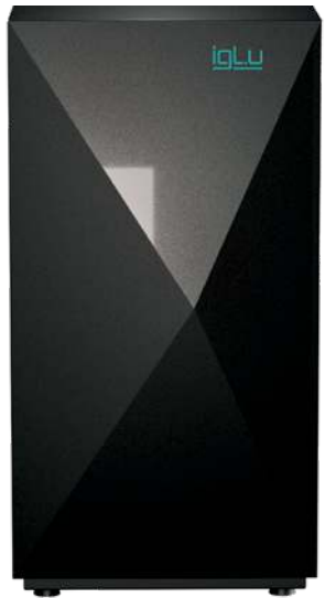
IGLU® Aleut heat pump without water heater

The IGLU Home app allows to control the device in real time, monitor the operating parameters of the heating system, electricity consumption, produced thermal energy and instantaneous efficiency factor.